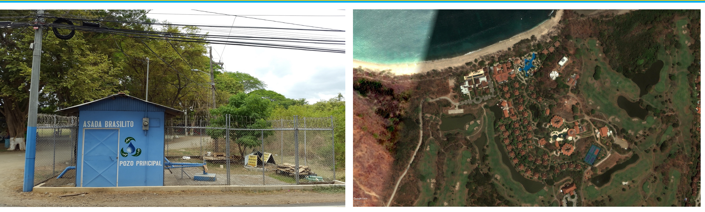
Figure 3 – Coastal well vulnerable to salt intrusion (left). Aerial view pb Playa Conchal, Brasilito showing real estate infrastructure in the coastal area of Santa Cruz, Guanacaste, Costa Rica (Google Earth 2018).

The challenge posed for water scarcity on insular and coastal areas from Puntarenas and Guanacaste requires a shift in water governance. Customarily, local populations relied on hard, grey, and large-scale infrastructure projects built by the Costa Rican state. However, such approach is increasingly showing limitations for facilitating water security, especially in small rural communities with limited economic potential and political capital. We argue that the decision-making process for selecting water technologies must be reviewed to identify sustainable options. Large investments in traditional hard infrastructure would be maximized if these are supported with soft adaptation