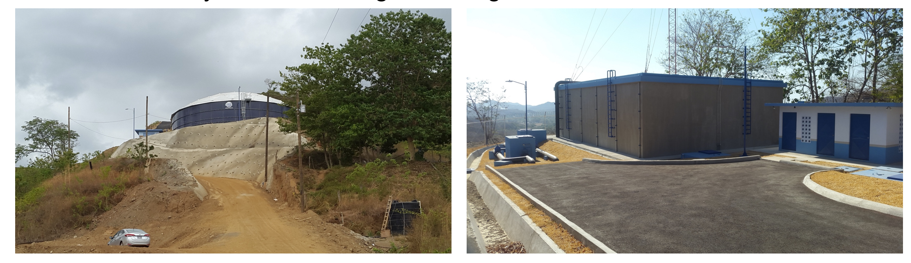
Figure 2 – Recent investments on water supply infrastructure for the coastal areas of Santa Cruz, Guanacaste, Costa Rica.

social processes for facilitating IWRM are needed.