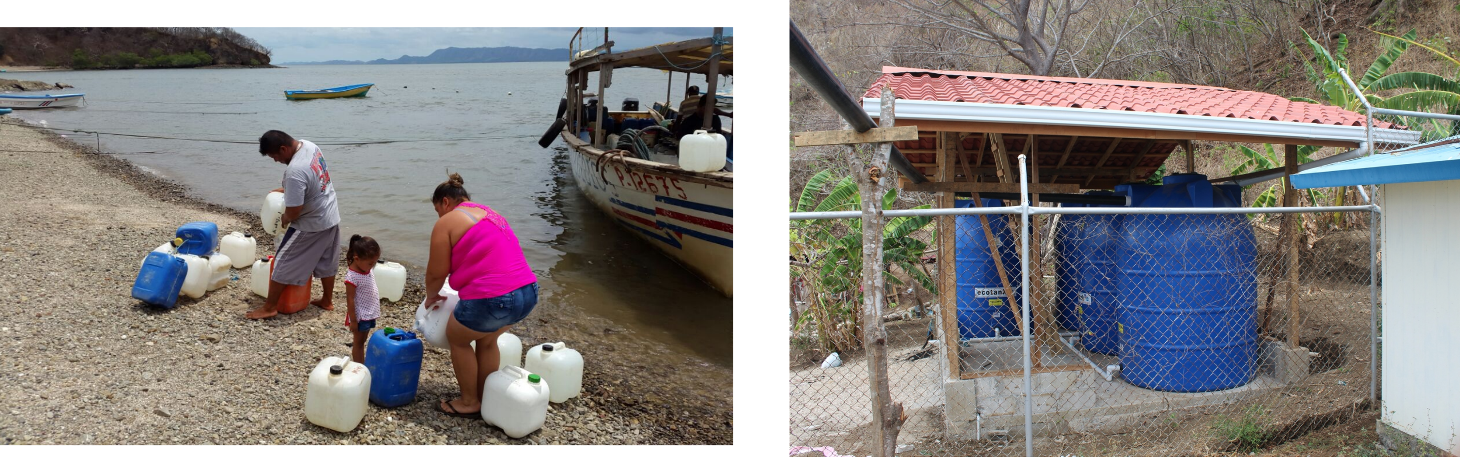
Figure 3– The inhabitants of Isla Caballo receive two water gallons/household/day for their domestic needs (left). The same community has a water harvesting and potabilization system built by CEMEDE as alternative supply source (right).

approaches, including co-management for IWRM.